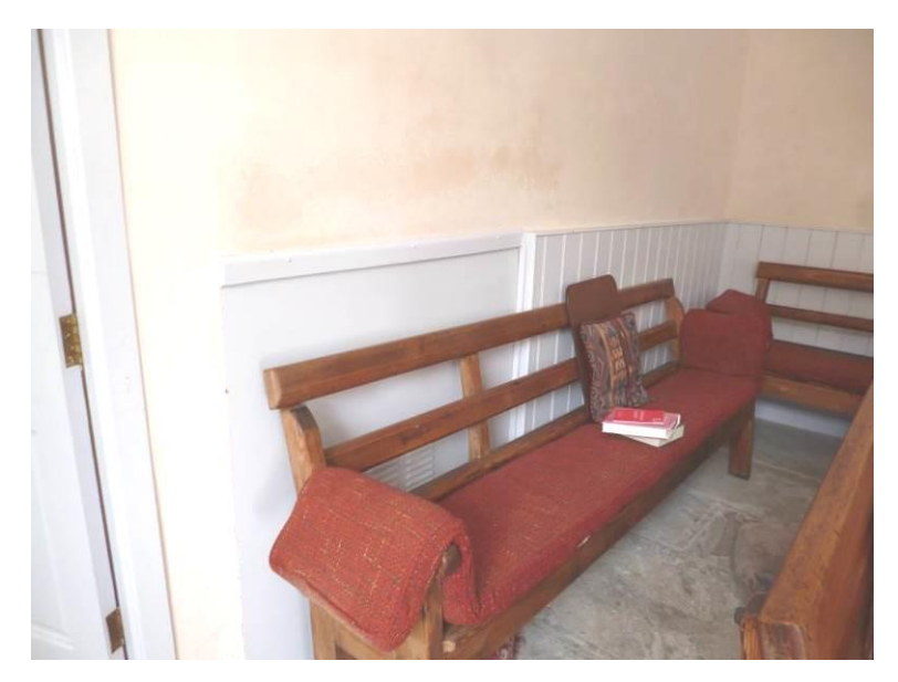
Fig.5: set of pine benches from Carperby meeting house

The set of plain pine benches are nineteenth century, and come from Carperby meeting (built in 1864).