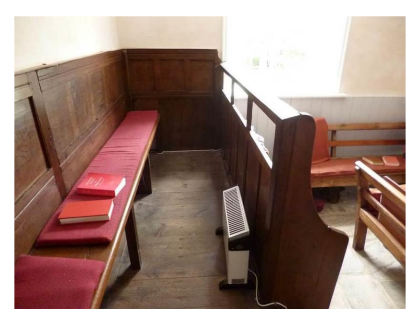
Fig.3: elders' stand with oak panelling

Inside, the meeting house, the larger meeting room is to the east, entered directly from the central door. The walls are lime-plastered above a painted timber tongued and grooved dado, and the floor is laid with stone flags. The elders' stand to the east end may be original; it is of oak with simple lineal mouldings and there is graffiti, including the name B.Talwin and the date 1731. There are signs the stand panelling was previously painted or lime-washed. The fixed benches either side of the central steps have fielded panels to the back, probably c1761. The small sash window (blocked) behind the centre of the stand is nineteenth century. The flat ceiling is plastered with the soffit at a higher level than the ceiling in the west room. The painted timber partition dividing the space has fielded panels consistent with a date of c1761; there is a central door below a pair of wider panels suggesting this was the primary doorway (the doors have been removed but are in store). The upper part of this doorway and the openings either side have top-hinged shutters which are fixed to the ceiling using iron hooks, enabling the spaces to be combined, above a low dado level. The door to the south end of the partition is a later insertion. The smaller space to the west has a blocked fireplace to the west wall, and the same boarded dado as the larger space. The door to the south side of the chimney is a modern insertion.