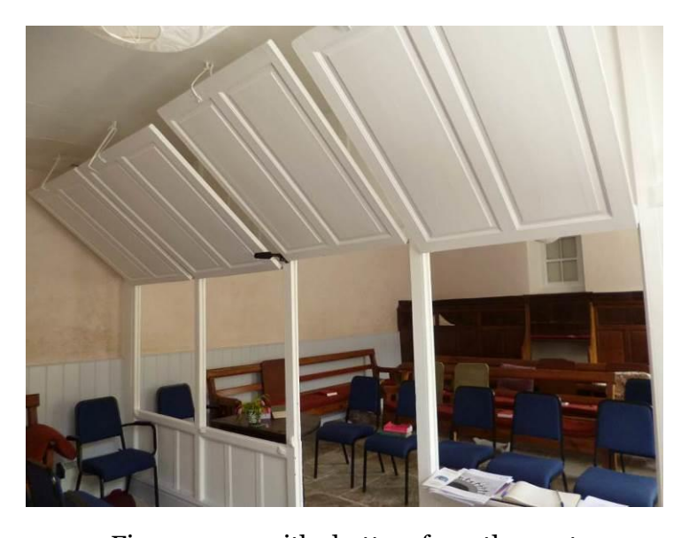
Fig.4: screen with shutters from the west

Inside, the meeting house, the larger meeting room is to the east, entered directly from the central door. The walls are lime-plastered above a painted timber tongued and grooved dado, and the floor is laid with stone flags. The elders' stand to the east end may be original; it is of oak with simple lineal mouldings and there is graffiti, including the name B.Talwin and the date 1731. There are signs the stand panelling was previously painted or lime-washed. The fixed benches either side of the central steps have fielded panels to the back, probably c1761. The small sash window (blocked) behind the centre of the stand is nineteenth century. The flat ceiling is plastered with the soffit at a higher level than the ceiling in the west room. The painted timber partition dividing the space has fielded panels consistent with a date of c1761; there is a central door below a pair of wider panels suggesting this was the primary doorway (the doors have been removed but are in store). The upper part of this doorway and the openings either side have top-hinged shutters which are fixed to the ceiling using iron hooks, enabling the spaces to be combined, above a low dado level. The door to the south end of the partition is a later insertion. The smaller space to the west has a blocked fireplace to the west wall, and the same boarded dado as the larger space. The door to the south side of the chimney is a modern insertion.