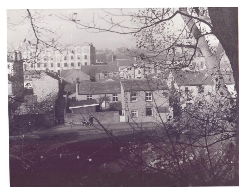
Fig.2: The meeting house prior to the west extension added in 1993

Committee for Famine Relief, the forerunner of Oxfam. A loft floor was inserted here and used for overnight accommodation from 1972. In 1988, the wooden floor in the meeting house was removed and the stone flags reinstated. To the west end the earlier lean-to extension was extended for a new lobby and WCs in 1993, to replace the old privy. The render was taken off the external walls, the stonework repointed and the interior lime-plastered. At the south end of the burial ground the stable was gradually adapted as a cottage for a warden, and in the 1950s a timber children's room was built in the south-west corner of the site (Fig.2). This was replaced by the New Room in 1994, built onto the cottage.